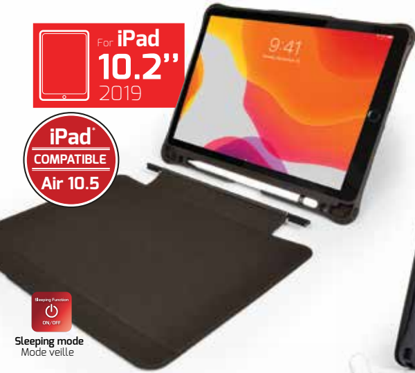
Screen protective flap Rabat de protection amovible pour l'écran