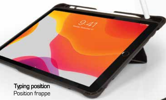
Typing position Position frappe