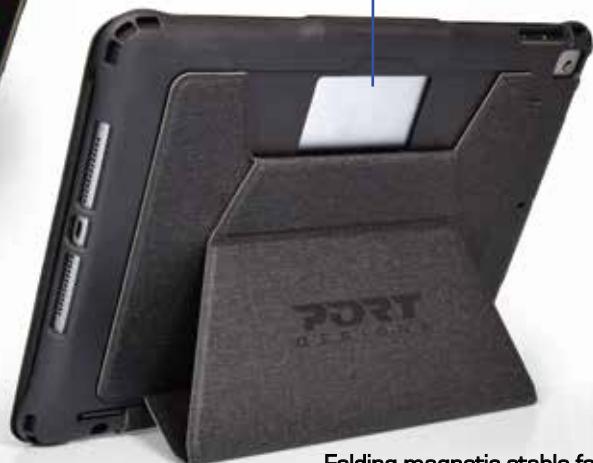
Folding magnetic stable foot Pied magnétique, pliant et stable