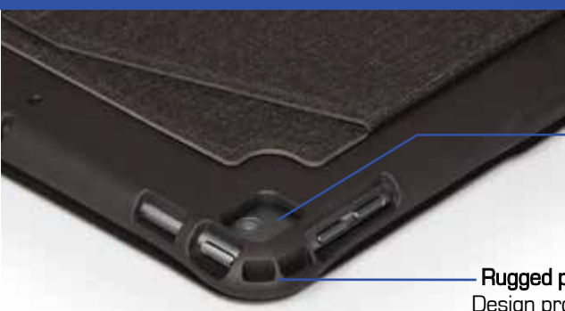
Rugged protective design Design protecteur renforcé