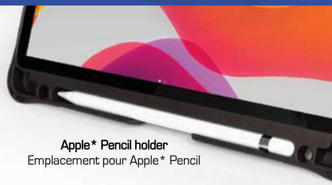
Apple* Pencil holder Emplacement pour Apple* Pencil