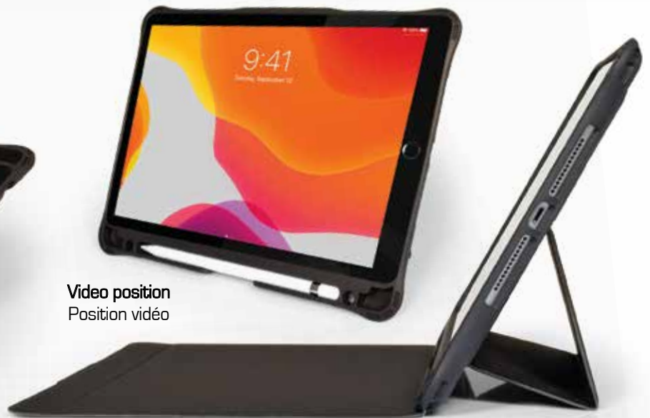
Video position Position vidéo