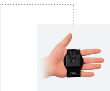
Rotative hand strap 360° Removable Ref. 001028