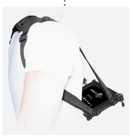
Easy shoulder strap 4 attachment points Ideal for typing Ref. 001024