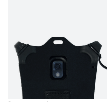
Bottom center ring (for tablet < 8'') Ref. 602F-TRH-1RINGB