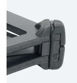
Bumpers (8 units) Ref. 602F-SAF-BUMPS8