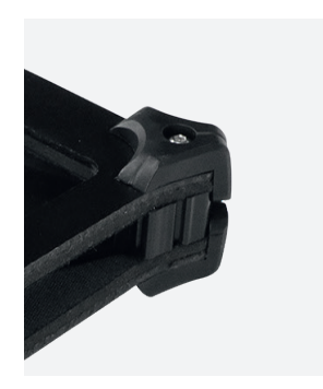
Bumpers with screw, high safety (8 units) Ref. 602F-SAF-BUMPS8-VIS

Tripod flap, non removable Ref. 602F-FLF-TRIFLT (top) Ref. 602F-FLF-TRIFLTB (bottom)