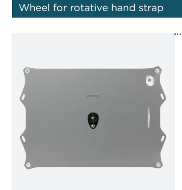
Ref. 602F-EAC-WHEEL Mandatory for rotative hand strap