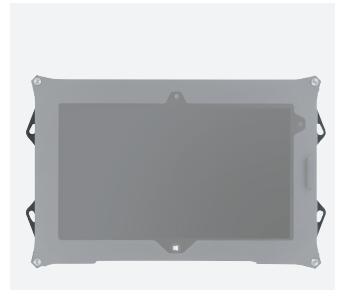
4 rings Ref. 602F-TRH-4RINGS