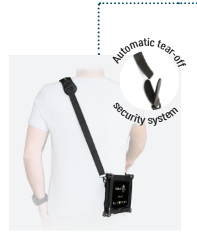
Safety carry shoulder strap 2 attachment points Ref. 001027